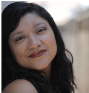
Reyna Grande The Distance Between Us